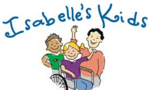
A National Initiative of United Cerebral Palsy

It's hard to be a kid. Just ask one. But for more than 5.2 million children and youth living with disabilities in the United States today, life can be far harder than it has to be. Often unable to effectively advocate for themselves, children and youth with disabilities may be isolated in their communities, schools and families, severely limiting their opportunities to reach their full potential. Learning may be many times more difficult for a child with a disability, making school an even more critical component to healthy growth. Children's physical, social and personal development may also be affected by their disabilities, and they nearly always face profound challenges in transitioning to adult life.